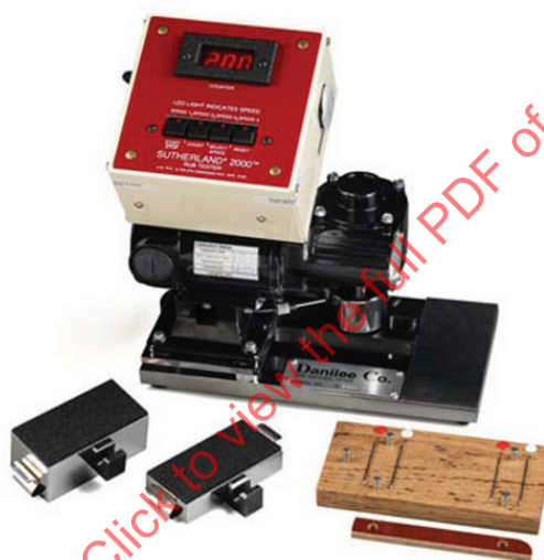
Figure A.1 — Test device described in ASTM D 5264, ASTM F 2497 and ASTM F 1571

The test device described in ASTM D 5264, ASTM F 2497, and ASTM F 1571 is depicted in Figure A.1 .